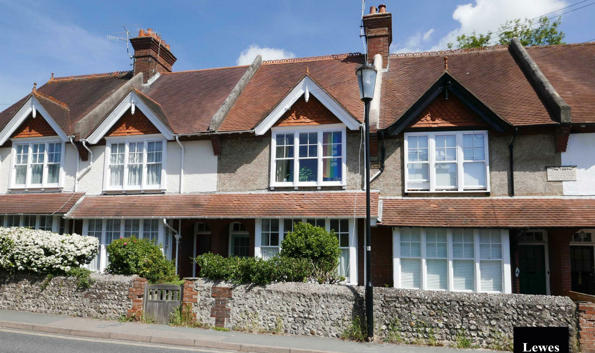
Lancaster Street, Lewes